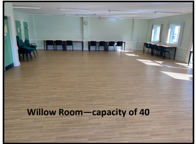
Willow Room—capacity of 40