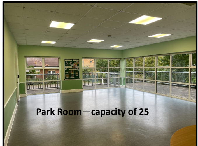
Park Room—capacity of 25