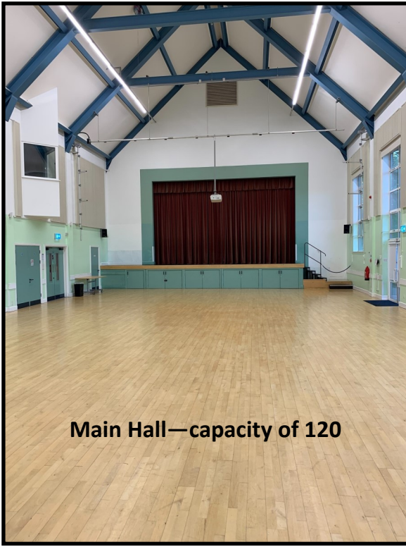
Main Hall—capacity of 120

We have 4 rooms available to hire. These are: